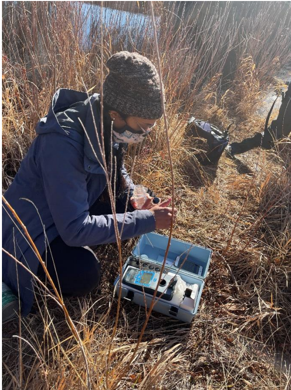
Figure 7 - Groundwork Denver Water Quality Monitoring

and construction designs to support funding requests for a major stream and wetland restoration project.