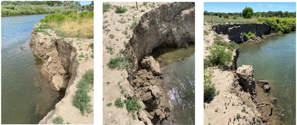
Figure 9 - Recent erosion between stations 9 and 7

TU presented this preliminary iterative design to CPW and AGRA. 3-Rocks and AGRA engineers are discussing several issues. AGRA is concerned this may not solve the issue and we are waiting to hear back from CPW what their review process is. Once in agreement, the proposed stabilization designs will be tested for shear stresses and results presented to stakeholders for review and approval. A contract extension was granted in July 2022.