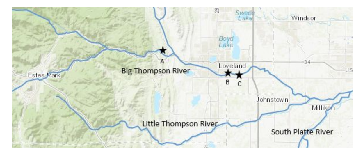
Figure 1. Macroinvertebrate and dissolved selenium sampling locations in the lower Big Thompson River, CO.